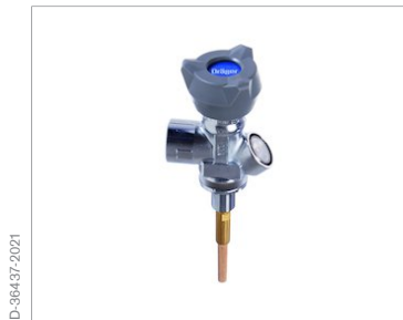
Inline Valve with indicator gauge (with Excess Flow Valve), according to EN144-2018