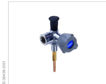
Right-angled Valve (with Excess Flow Valve), according to EN144-2018