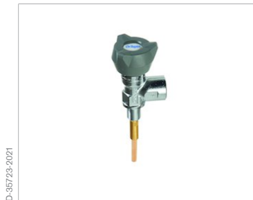
Inline Valve (with Excess Flow Valve), according to EN144-2005